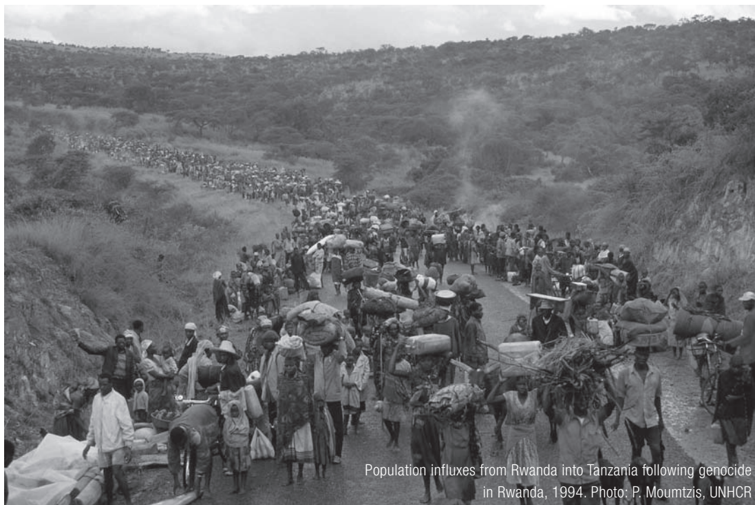
Population influxes from Rwanda into Tanzania following genocide in Rwanda, 1994.

Forced displacement is mainly caused by the insecurity of armed conflict. Conflicts that cause refugee movements across international borders by definition involve neighbouring States, and thus have regional security implications. As is evident in recent conflicts in Africa in particular, the lines of conflict frequently run across State boundaries, because they are being fought by people with ethnic, cultural, political and military ties that are not confined to one country. The mixed movements of populations that result are very complex and involve not only refugees, but also combatants and civilians associated with armed groups and forces, including family members and other dependants, cross-border abductees, etc.