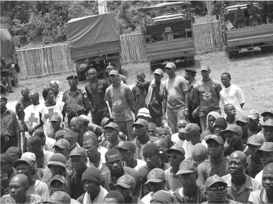
Liberian former combatants, who were interned in Sierra Leone during the Liberian civil war, listen to speeches of welcome upon their repatriation and incorporation in the Liberia DDR programme in 2005. Returning home is usually the best solution for cross-border combatants.

in appropriate DDR programmes in their country of origin. Entitlements should be synchronized with DDR assistance received in the host country, e.g., if disarmament and demobilization has been carried out in the host country, then reintegration is likely to be the most important process for repatriated former combatants in the country of origin. Lack of reintegration may contribute to future cross-border movements of combatants and mercenaries.