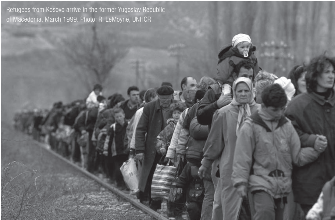
Refugees from Kosovo arrive in the former Yugoslav Republic of Macedonia, March 1999.

The often-interconnected nature of conflicts within a region, recruitment (both forced and voluntary) across borders and the ‘recycling’ of combatants from conflict to conflict within a region has meant that not only nationals of a country at war, but also foreign combatants may be involved in the struggle. When wars come to an end, it is not only refugees who are in need of repatriation and reintegration, but also foreign combatants and associated civilians. DDR programmes need to be regional in scope in order to deal with this reality.